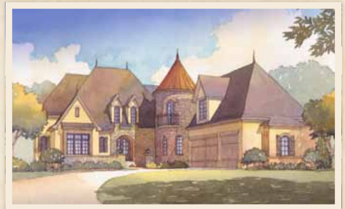
Luxury home design by Jim Phelps | www.jimphelpscollection.com

Lot 9 is the anchor of the Vineyards of Gimpl Hill, a lot that has both westerly lake views and easterly mountain views. As such, the house that eventually lives on Lot 9 must be architecturally special, and THE CHENEVIERE fits that mold.