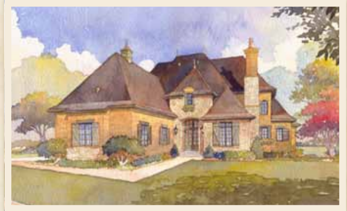
Luxury home design by Jim Phelps | www.jimphelpscollection.com

Welcome to Lots 5 & 8, where Lot 5 has ease of hiking trail access and westerly views while 8 boasts some of the best grape-growing soil in the Willamette Valley ( Bellpine ). Lot 5 is one of the best views for the money, and lot 8 enjoys views of Spencer Butte that will frame your personal vineyard below. THE DEAUVILLE was selected as a great fit for either lot, as this French Country Home has some unique qualities in the floor plan design, each space facing the back were designed to take full advantage of the views that each lot has to offer.