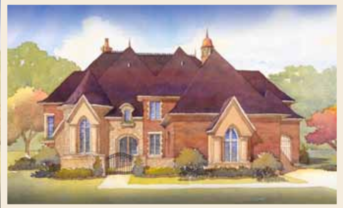
Luxury home design by Jim Phelps | www.jimphelpscollecton.com

Lots 2, 3 & 4 have some of the most incredible, unobstructed views to the West. With the sun setting and glistening off of the surface of Fern Ridge Lake, these two lots have a special setting and must have a house that takes advantage of what they have to offer.